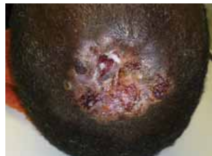
Figure 1 Ulcerating wound on the frontoparietal side of the skull

A malignancy such as a squamous cell carcinoma or a basal cell carcinoma was suspected. To treat possible secondary osteomyelitis an oral course of cloxacillin was started. To exclude any other possible underlying diseases Consult Online was asked for advice about differential diagnosis and further treatment.