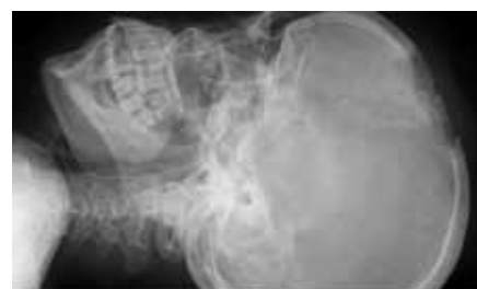
Figure 2 X-ray of the skull showing destruction and infiltration of the frontoparietal cortex