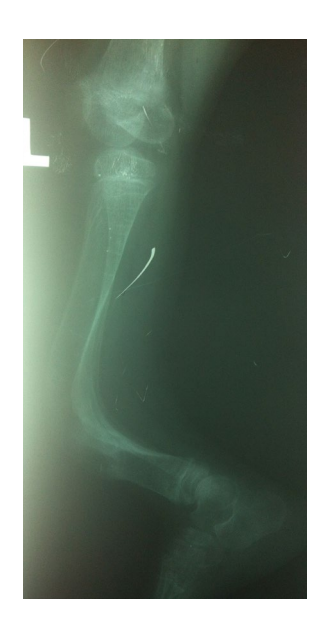
The X-ray of the left lower leg showed anterior bending of the diaphysis of the tibia with signs of microfractures and an old fracture. The fracture could have caused the more pronounced bending of the left leg. Besides the old fracture and the anterior bending, no other abnormalities were observed.